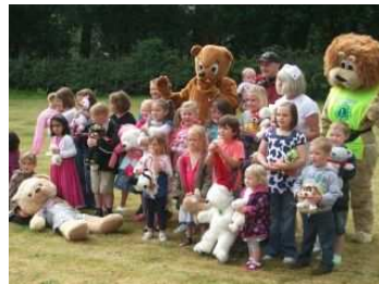
Photo: The Lion lost amongst the bears.