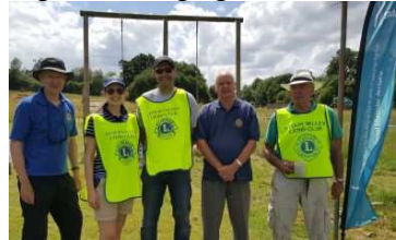
Photo: Members of Northleach & Fosse and Stour Valley Lions Clubs on the finish line at the SMA Trust Mud Run.

Club members have unanimously supported their Welfare Committee's proposals to make donations to the Lions Clubs national Multiple District Disaster Fund for the Grenfell Tower residents, as well as to the Cobalt diagnostic imaging unit in Cheltenham.