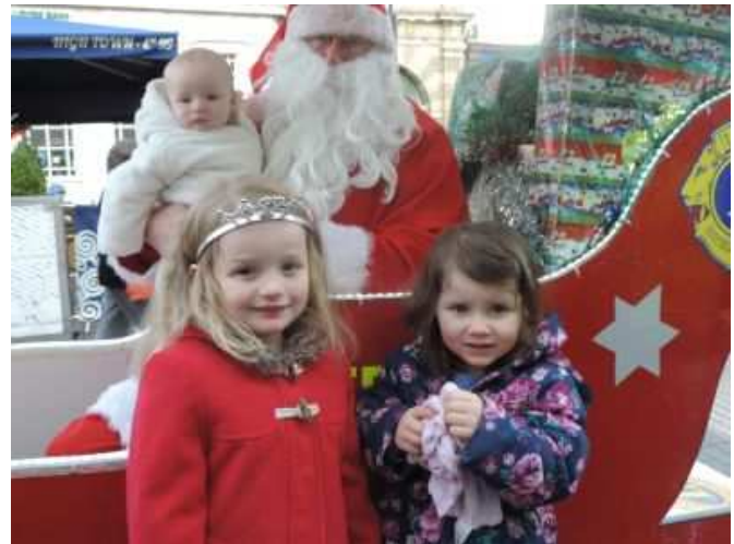
Santa boosts charity funds.